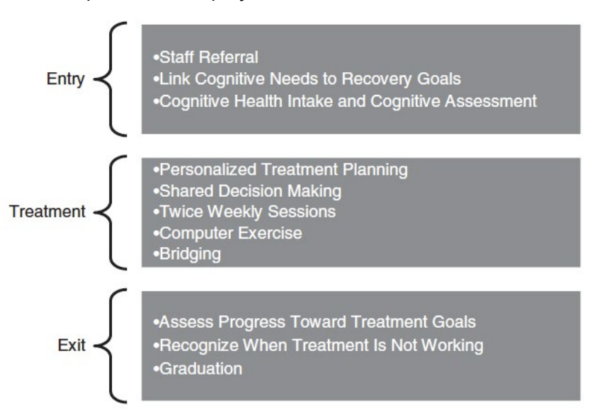
Figure 2: Cognitive remediation program

A typical course of cognitive remediation would entail 2-3 sessions per week, 1-2 hours per session over 10-30 weeks, although these vary across settings, especially if more components are provided<sup>7, 9-11</sup>. At least 50% of intervention time will be devoted to computerised cognitive training exercises, and some programs provide homework assignments aiming to practice the new skills in everyday life situations or to reflect on progress. The entire program, conceptualised as a 3-phase process, is summarised in figure 2 based on a report of the Cognitive Remediation to Promote Recovery (CR2PR), a successful state-wide implementation project in New York.<sup>8</sup>